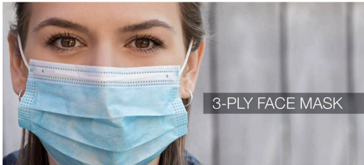
3-PLY FACE MASK

The Disposable 3-Ply Face Mask is composed of 3 ply fabric. Above 95% BFE (Bacterial Filtration Efficiency). $1.50 each for 300 units / $1.39 each for 1000 units